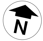
1 Proposed Site Plan Scale: 1:500

daprato design Ltd Architectural and Interior Design Consultants 10 Woodhouse Place, London N12 6JF South Africa www.daprato.co.uk © 2020 dART ALL RIGHTS RESERVED